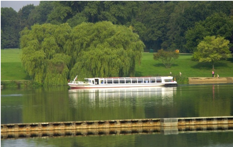
Board a pleasure boat in Hamburg and enjoy a leisurely cruise.

Using the bustling port city of Hamburg as a gateway, CHRISTINA NG discovers the mediaeval charm and rich sailing heritage of the cities within north Germany's Schleswig-Holstein state.