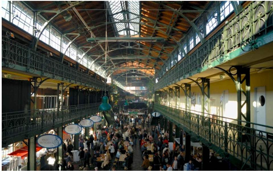
There's never a dull moment at the Hamburg Fish Market.

The boat trips are a great way to while away a languid afternoon, but if you prefer more excitement, make it a point to check out Hamburg's fish market along the banks of the Elbe River.