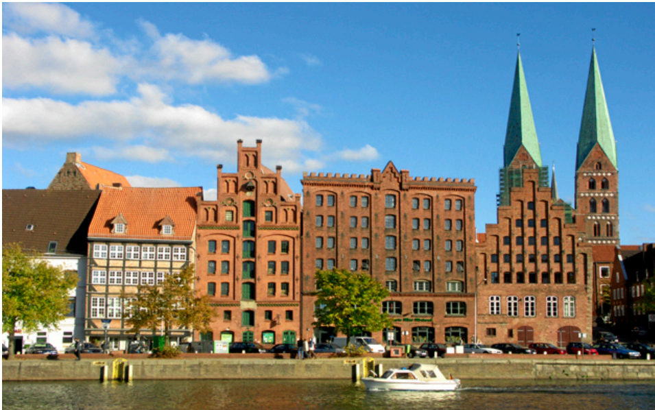
Buildings in Lübeck's Old Town consist of a variety of architectural styles.

Just a 50-minute drive north-east or an hour's train ride from Hamburg brings you to the quaint port city of Lübeck. Founded in 1143 as the first German city on the Baltic Sea, Lübeck was the principal city of a league of trading cities – known as the Hanseatic League – which monopolised the trade of the Baltic and North Seas from the 13th to the 15th century.