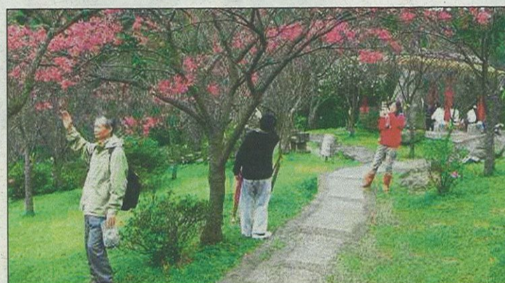
PRETTY: Actor Jack Yao recommends Yangmingshan National Park as a good spot for night dates.